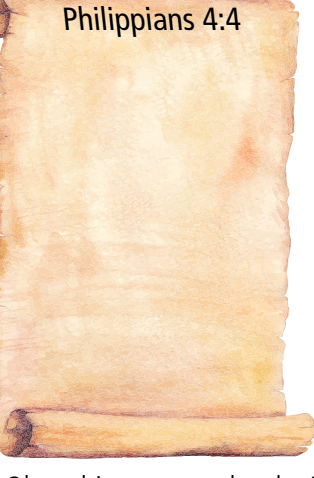
Obey this command today!

commands for you by reading God's Word too. Look up the Bible passage on the scroll and write the command God's wants you to obey.