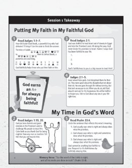
Student Book Page 4

If you have not ordered the Strong Kids at Home sheets for this quarter, we encourage you to do so. They provide a valuable connection between your classroom and the home.